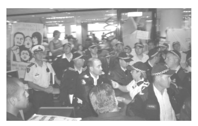
"We're the police. We're here to help you free education..."

After quickly and politely evicting the admin